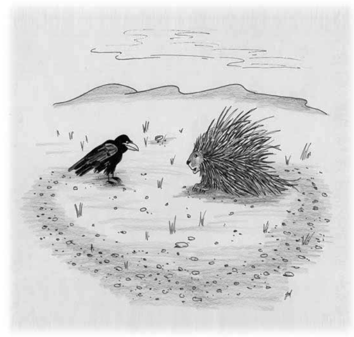
"The quills protect me from creditors."

Remember, use your Credit Canada Monthly Budget Tracker or the expense guide on Page 13 of this booklet to track your expenses and identify areas where adjustments need to be made.