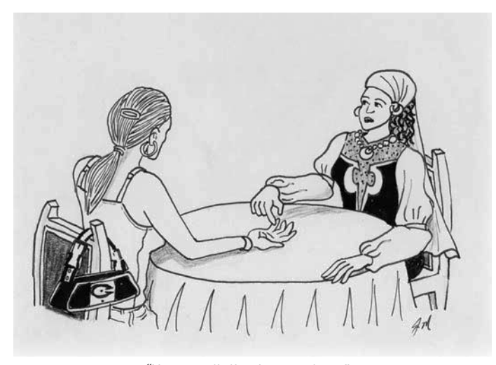
"Your credit line is very short."

In the end, you could end up paying $320.00 plus service charges.