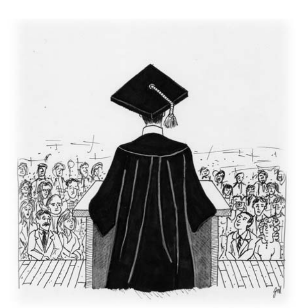
"Graduates, faculty, parents, creditors ..."

As you consider obtaining credit, familiarize yourself with common terms relating to the field. As one who pays for goods and services and seeks out credit, you are defined as the consumer. The lender, or one who offers you credit, is known as the creditor or credit grantor.